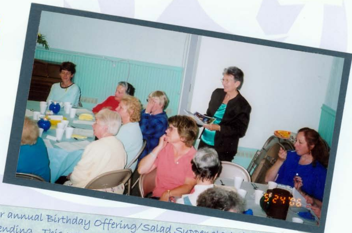
Our annual Birthday Offering/Salad Supper started with 35 people attending. This year we had ninety women from six different churches. Half the offering now goes to Fulmont Community Action Agency to help needy people locally.