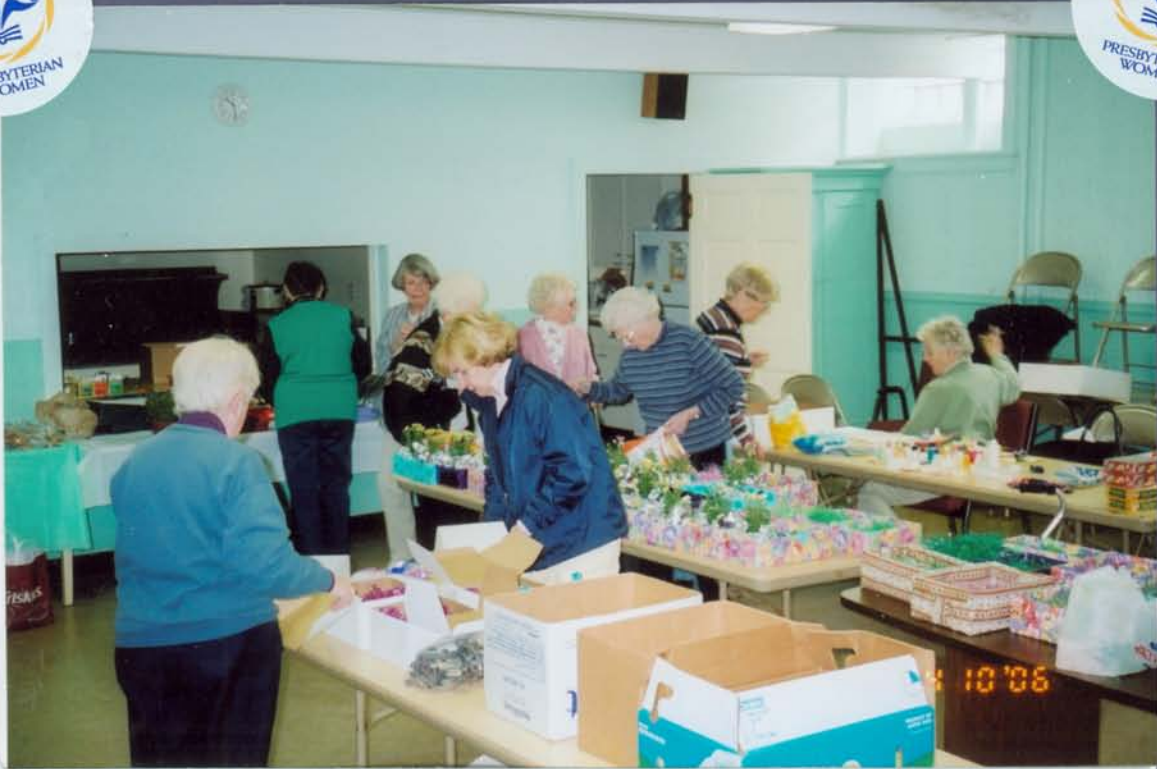
At Easter time PW makes Cheer Boxes for all the shut-ins that we can learn of. This past year we distributed thirty some baskets. This year the "Friendship Callers" will help distribute the boxes.